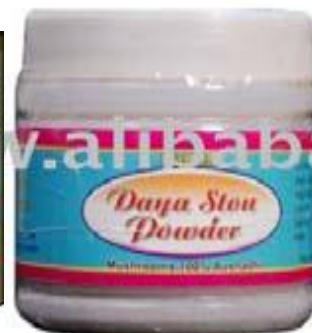
Fig 27: Daya Stone powder