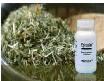
Fig 29: Episulin

ACKNOWLEDGMENT: I am very thankful to Principal, Columbia College of pharmacy Raipur Chhattisgarh and my teachers for their valuable guidance. I am also thankful to my colleagues for their time to time support.