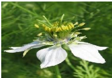
Fig20: Nigella sativa