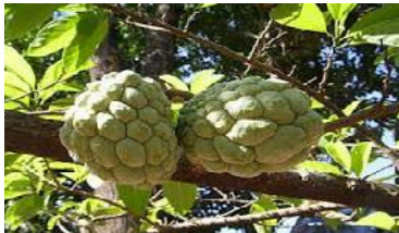
Fig7: Annona Squamosa

It is a flowering plant native to western Eurasia and adjacent regions, such as North Africa, the Canary Islands and South Asia. Administration of trihydroxyoctadecadienoic acids obtained from the roots of the native Armenian plant B. alba L. (0.05 mg/kg/day for 15 days. Lin.) restores the disordered lipid metabolism of alloxan-diabetic rats. Metabolic changes induced in diabetes significantly restores towards their normal values with the exception of diminished triglyceride content of muscle which does not restore. Thus, they can influence the profile of the formation of stable prostaglandins by actions downstream of prostaglandin endoperoxides. 42