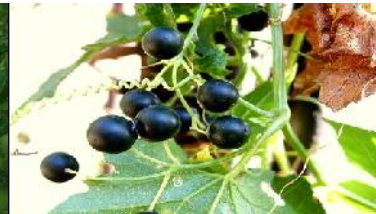
Fig9: Bryonia Alba