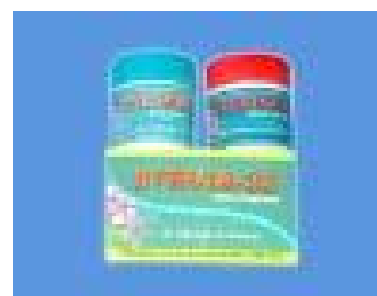
Fig 24: Stevia-33