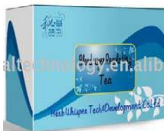
Fig 22: Sharang Dyab-Tea