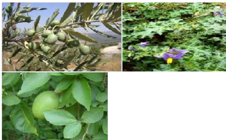
Fig16: Ougeinia oojeinensis Fig17: Solanum xanthocarpum Fig18:Aegle marmelos