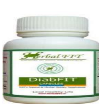
Fig 25: Diab-FIT