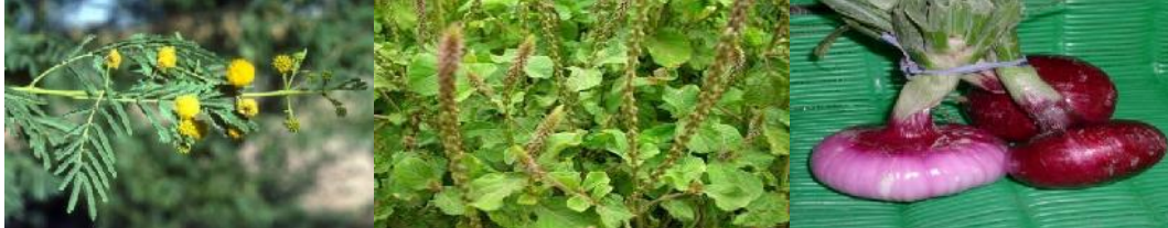
Fig1: Acacia Arabica

It normalizes the activities of liver hexokinase, glucose 6-phosphatase and HMG Co A reductase . 27, 28 When diabetic patients were given single oral dose of 50 g of onion juice, it significantly controlled post-prandial glucose levels. 29, 30