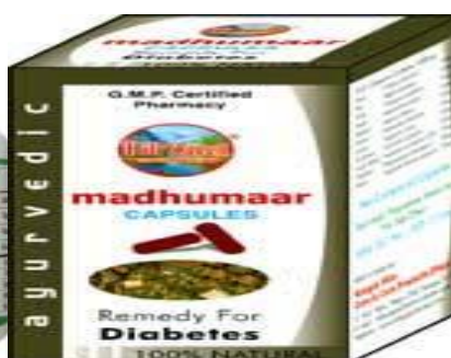
Fig 26: Madhumar Capsule