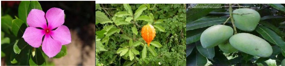
Fig10: Catharanthus roseus Fig11: Momordica charantia Fig12: Mangifera indica