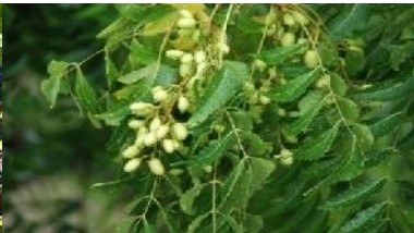
Fig: 8 Azadirachta-Indica