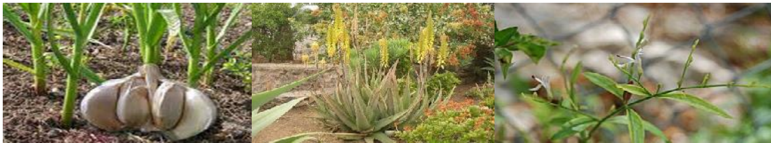
Fig4: Allium Sativum Paniculata

It is a herbaceous plant native to India, Sri Lanka and widely cultivated in southern Asia. Oral administration of andrographis significantly increases the activity of SOD and Catalase. Also decreases blood glucose levels due to its antioxidant properties. The ethanolic extract of A. paniculata possesses antidiabetic property and may be attributed at least in part to increase glucose metabolism. Its hypotriglyceridemic effect is also beneficial in the diabetic state . 37,38