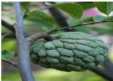
Fig19: Annona squamosa

Plant formulation and combined extracts of plants are used a drug of choice rather than individual. Various herbal formulations such as diamed, coagent db, Diasulin. .Polyherbal formulation of Annona squamosa and Nigella sativa on blood glucose, plasma insulin, tissue lipid profile, and lipidperoxidation in streptozotocin induced diabetic rats.(Fig19,20 )Aqueous extract of Polyherbal formulation of was administered orally (200 mg/kg body weight) for 30 days. 21 The different doses of Polyherbal formulation on blood glucose and plasma insulin in diabetic rats were studied and the levels of lipid peroxides and tissue lipids were also estimated in streptozotocin induced diabetic rats. The effects were compared with tolbutamide. Treatment with Polyherbal formulation and tolbutamide resulted in a significant reduction of blood glucose and increase in plasma insulin. 79, 80