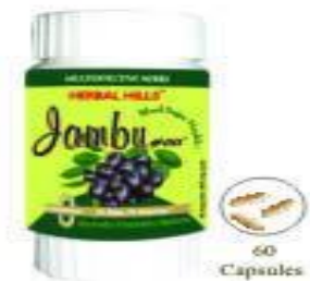
Fig 23: Herbal Hills Jambu